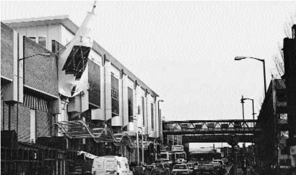
Figure 3.23 The Broadmarsh Centre, Nottingham.