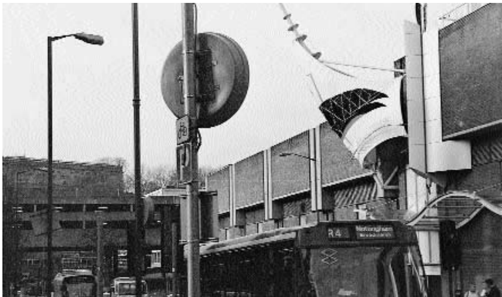
Figure 3.24 The Broadmarsh Centre, Nottingham.